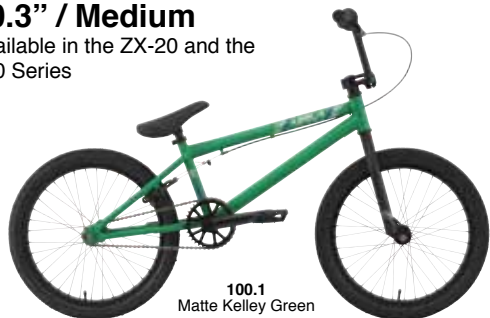
100.1 Matte Kelley Green

Available in the ZX-20 and the 100 Series