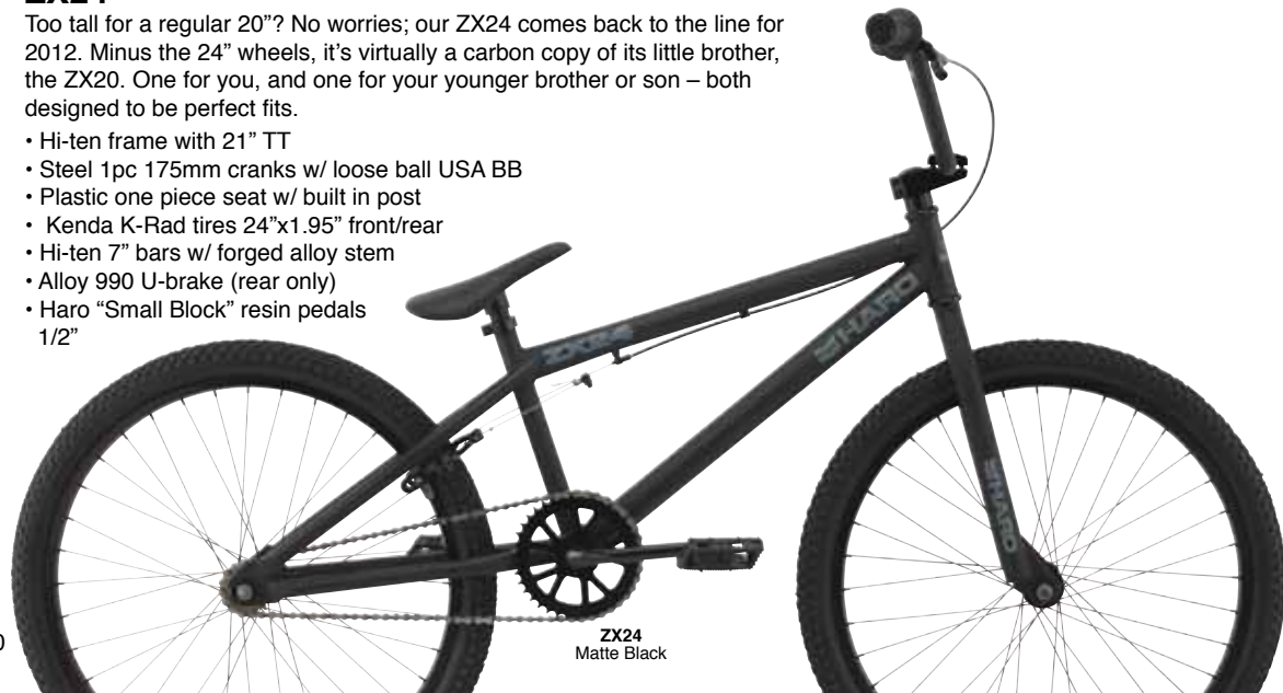
ZX24 Matte Black