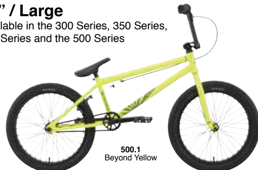
500.1 Beyond Yellow

Available in the 300 Series, 350 Series, 400 Series and the 500 Series