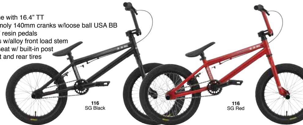
116 SG Black