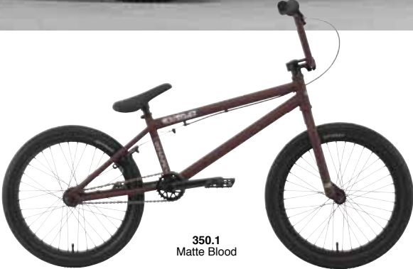
350.1 Matte Blood