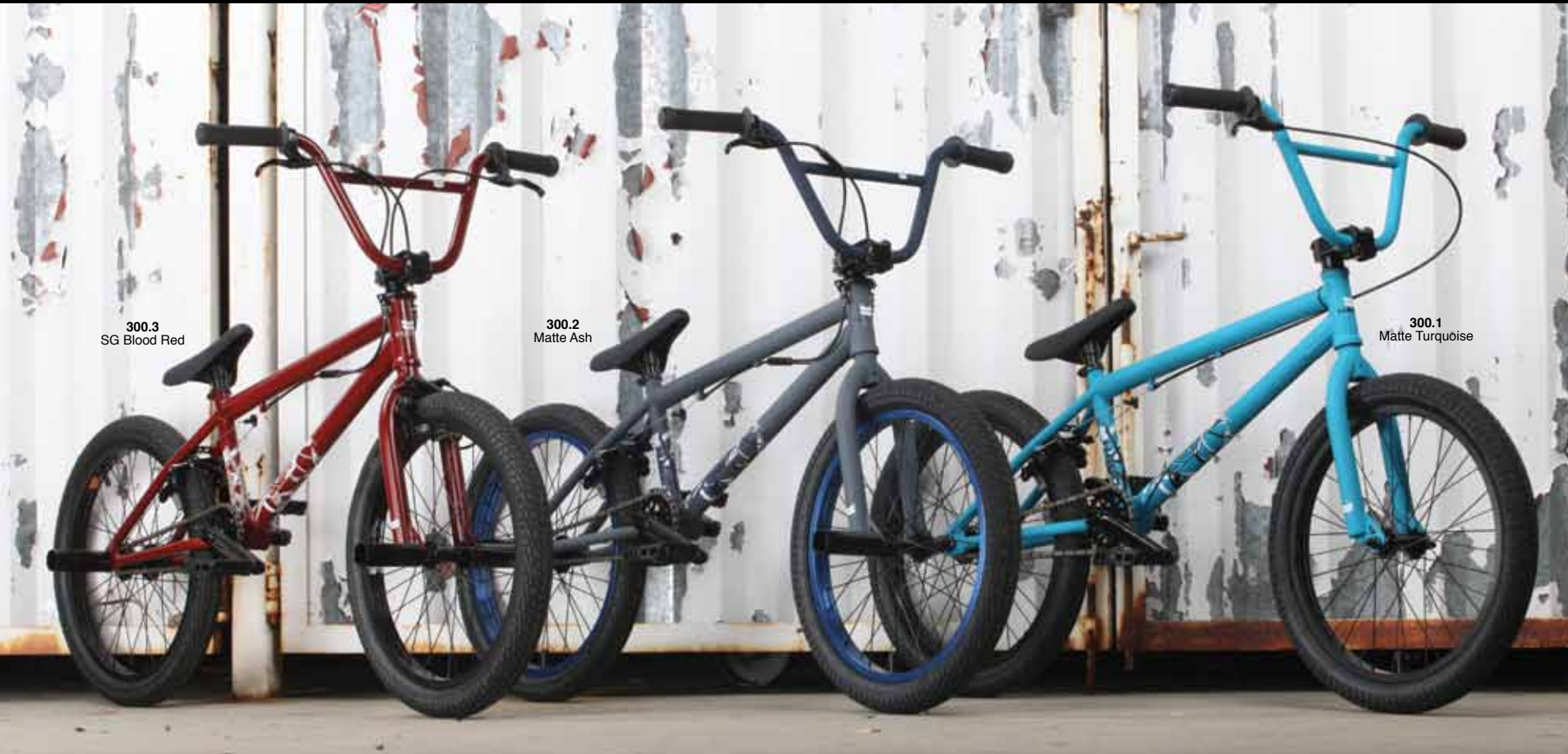
300.3 SG Blood Red