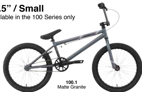
100.1 Matte Granite