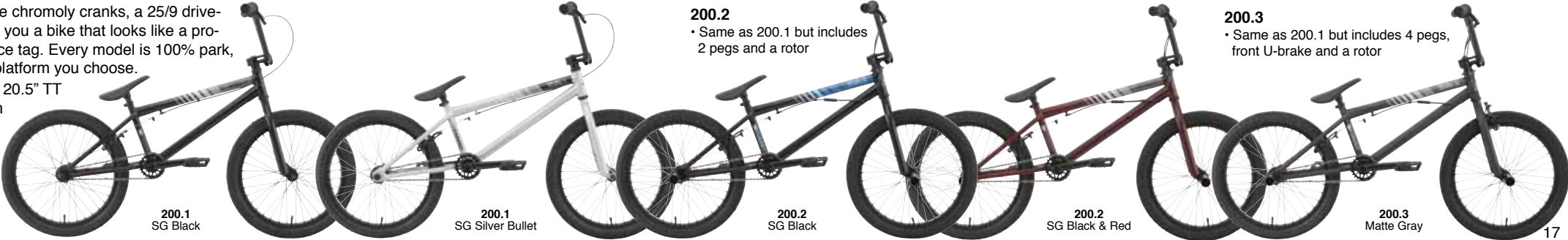
200.1 SG Black

Each model features three piece chromoly cranks, a 25/9 drive-train and full 8" rise bars, giving you a bike that looks like a pro-level ride without a pro level price tag. Every model is 100% park, street and trails worthy, in any platform you choose. • Full hi-ten frame with a 20" or 20.5" TT • 3 pc chromoly 8 spline 175mm cranks w/ USA loose ball BB • Kenda Contact tires 20"x2.25" front/20"x1.95" rear • Alloy 990 U-brake • 8" bar w/alloy front load stem • 25/9 gearing