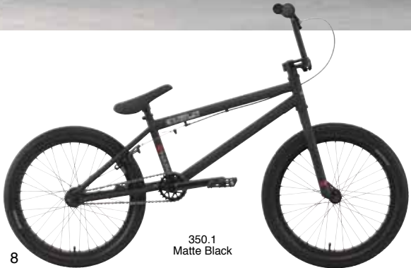
350.1 Matte Black