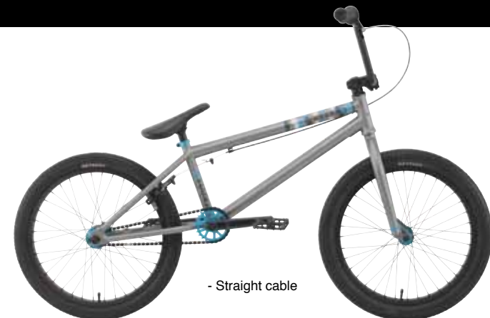
- Straight cable

The .1 platform is our bare bones freestyle platform - no pegs, no detangler, no worries. The .1 platform is used for the most pure form of street, ramp or dirt riding. The riders that prefer a .1 platform are the type of riders that are more concerned with style over tricks. The .1 platform also appeals to riders who want the simplest, lightest bike they can get. This rider could also just want a cool looking BMX to commute on.