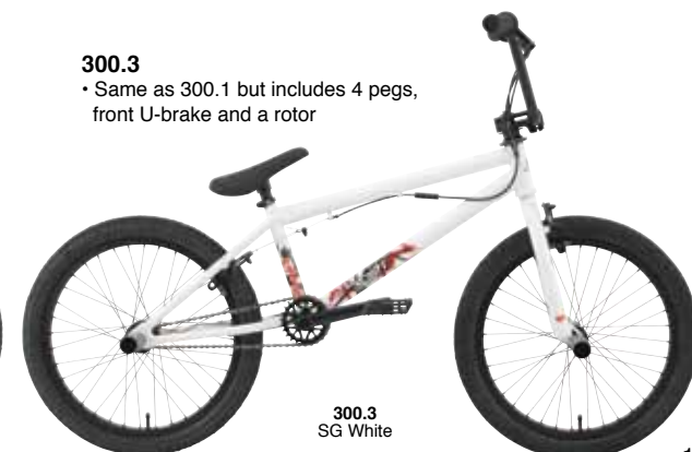
300.3 SG White