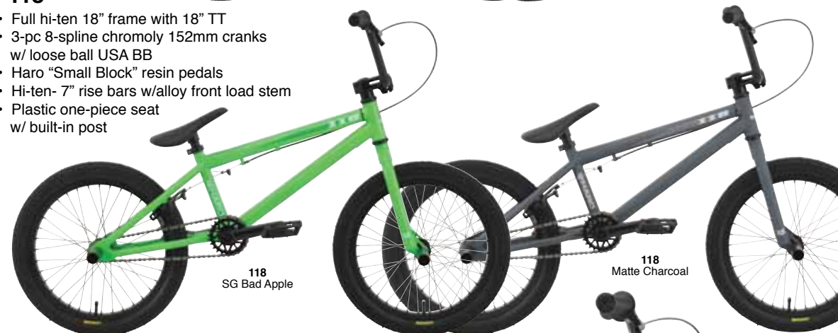
118 SG Bad Apple