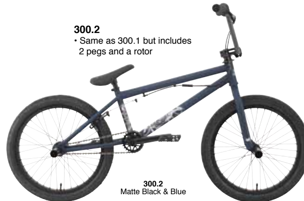
300.2 Matte Black & Blue