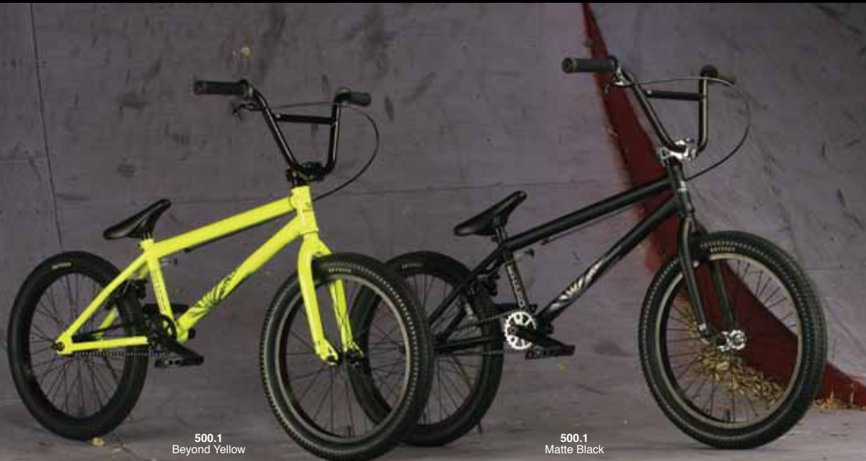
500.1 Beyond Yellow