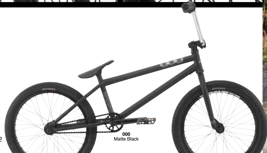
000 Matte Black