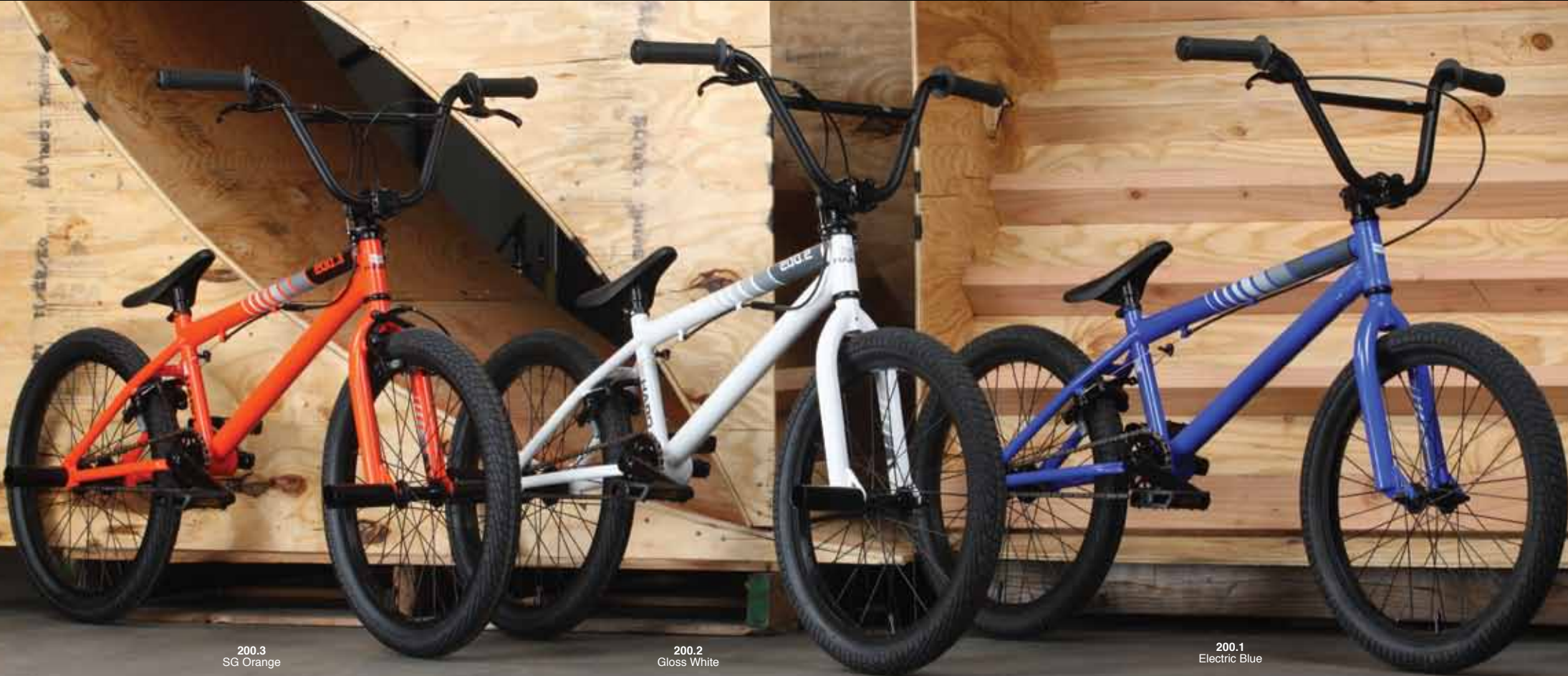
200.3 SG Orange