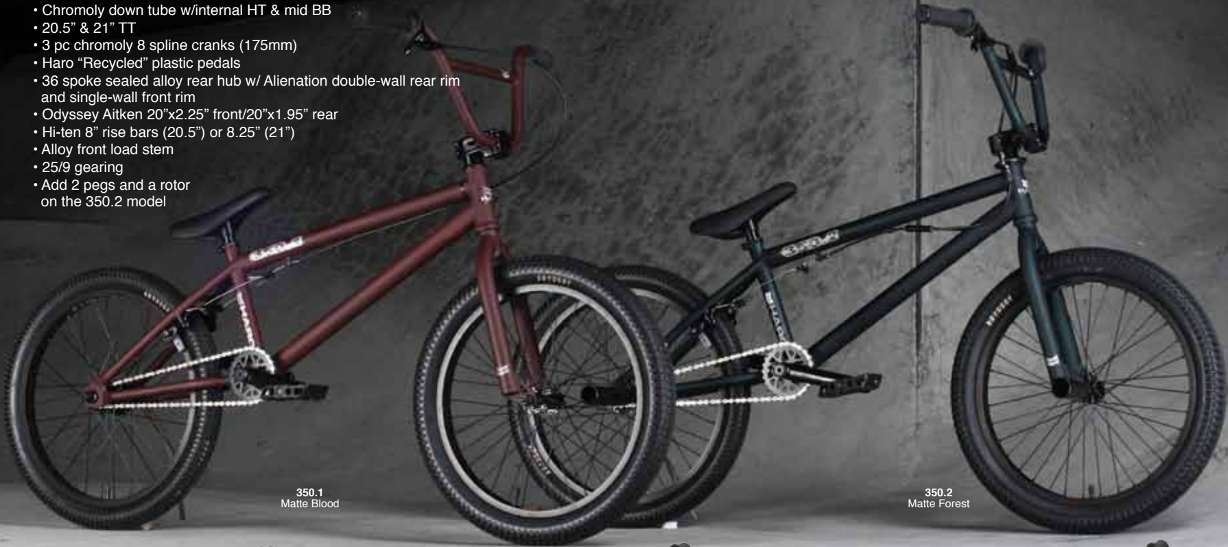
350.1 Matte Blood