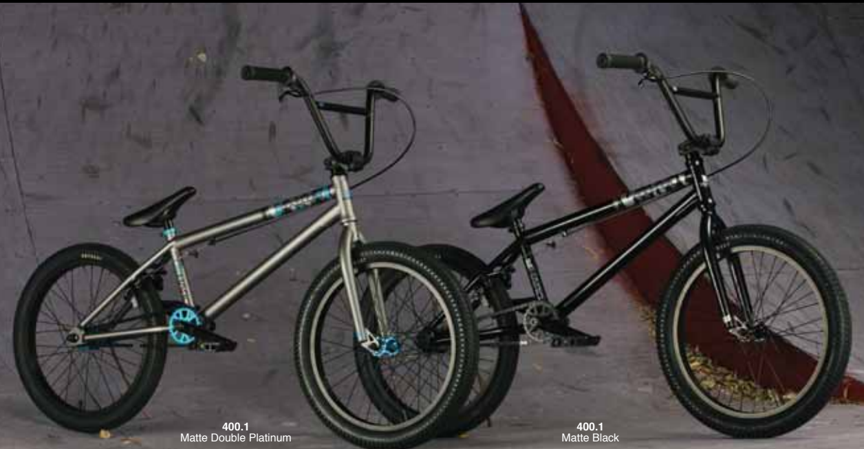
400.1 Matte Double Platinum