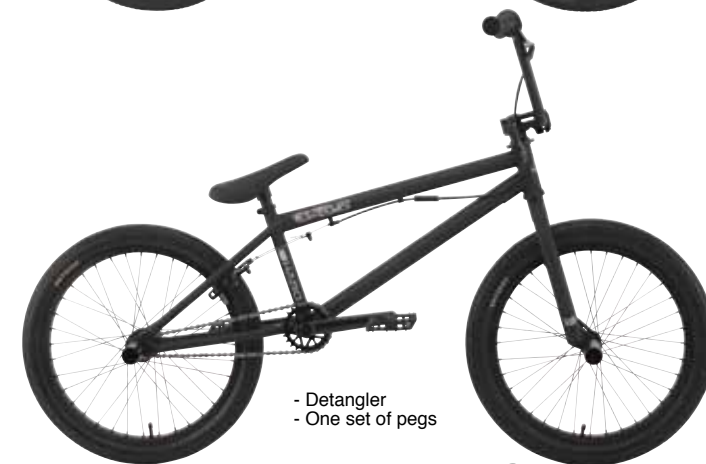
- Detangler - One set of pegs

The .2 platform is for a rider that has tricks on their mind. It comes with a detangler that can be used when double-trucking over the box at the park, tail whipping a set of doubles at the trails or a 180 bar spin down a 10 stair at the local high school. It also has one set of pegs for stalling on sub boxes or sliding hand rails.