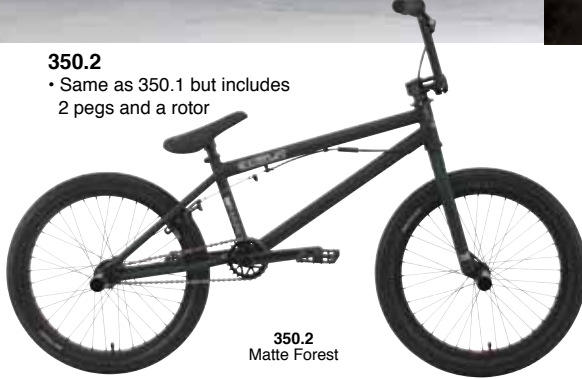
350.2 Matte Forest