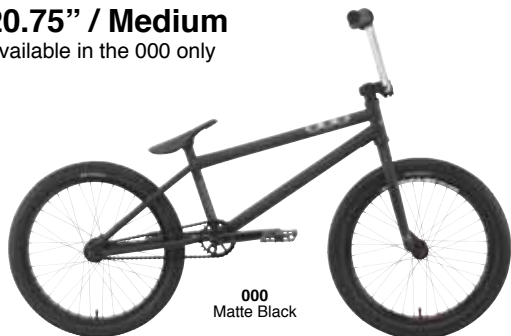
000 Matte Black