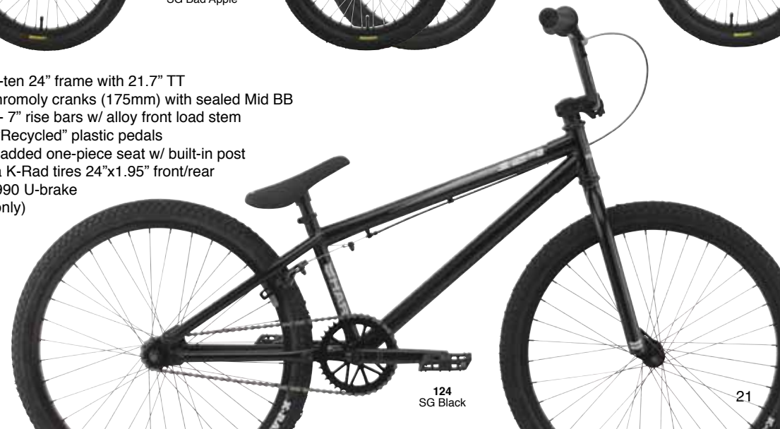
124 SG Black