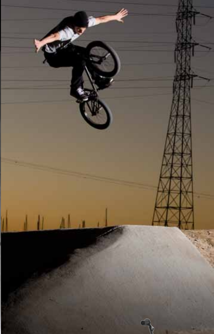
350.2 Matte Forest