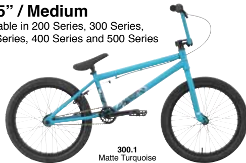
300.1 Matte Turquoise

Available in 200 Series, 300 Series, 350 Series, 400 Series and 500 Series