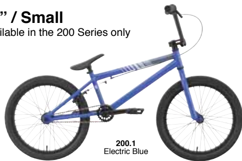
200.1 Electric Blue