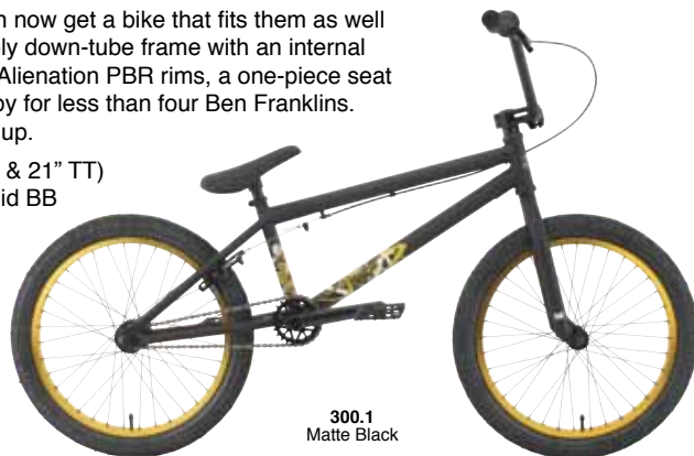
300.1 Matte Black