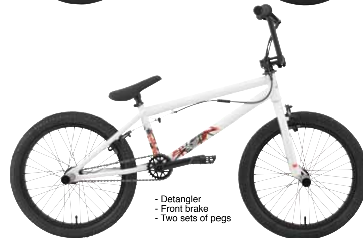
- Detangler - Front brake - Two sets of pegs

The .3 platform has all the bells and whistles; there isn't a trick in the book that the .3 platform isn't capable of doing. The .3 comes with a detangler, 4 pegs, and front and rear 990 style brakes and is ready for what ever you can throw its way.