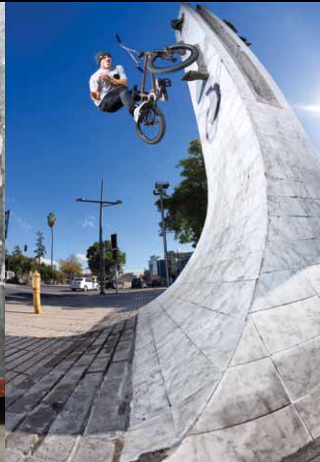
300.1 Matte Turquoise

Available with a 20.5" or 21" top tube, taller riders can now get a bike that fits them as well as their wallets. Each model is built around a chromoly down-tube frame with an internal head tube, and comes spec'd with a sealed Mid BB, Alienation PBR rims, a one-piece seat and post combo, and a 25/9 drivetrain. Not too shabby for less than four Ben Franklins. And just like last year, they come in a .1, .2, or .3 set up.