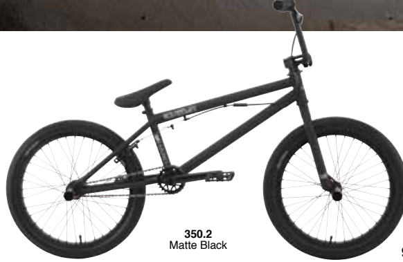
350.2 Matte Black

350.2 • Same as 350.1 but includes 2 pegs and a rotor