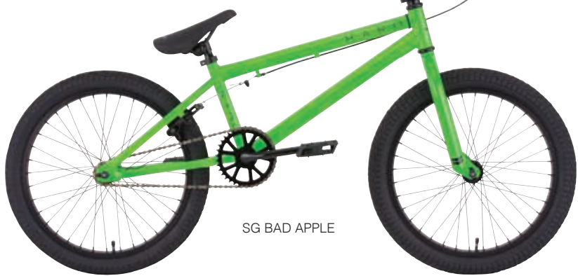
SG BAD APPLE