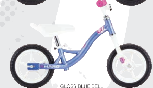
GLOSS BLUE BELL