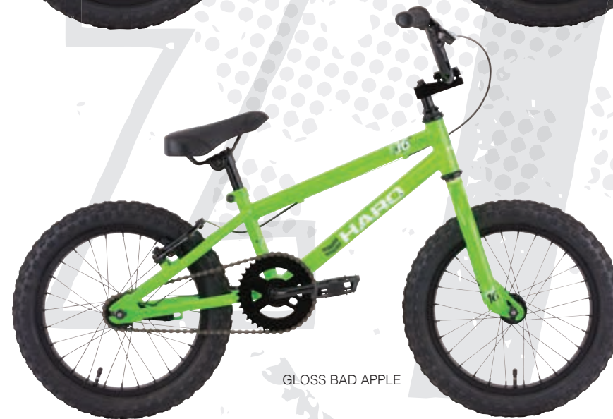
GLOSS BAD APPLE