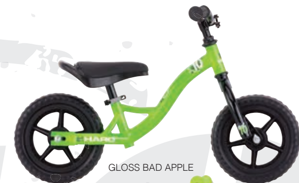
GLOSS BAD APPLE