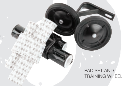
PAD SET AND TRAINING WHEELS