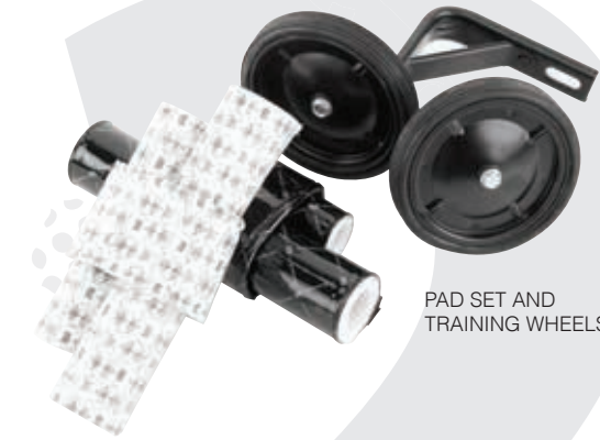
PAD SET AND TRAINING WHEELS